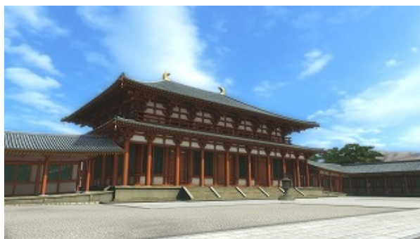
The Chukondo as recreated in “The Recreated Kohfukuji Chukondo” VR production

“The Ashura Statue” VR production is the world’s first virtual reality representation of the Ashura statue, a national treasure that is a famous piece of Tenpyo sculpture, highly popular with a diverse audience because of its expression, which seems to show sadness. The statue has been recreated in detail using ultra-high definition photography and the digital archiving knowhow that Toppan Printing has accumulated through 3D nd color measurement technologies. This means that it is possible to see the Ashura statue from various angles and in closeup, something that cannot be achieved with the actual statue. It is possible to see various aspects of the Ashura statue because a feature has been added whereby the color is completely removed so that the fine details of the statue can be seen, something that can only be done with VR.