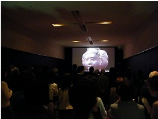
A screening at the VR Theater

Both productions were shown for the first time from Tuesday March 31 to Sunday June 7, 2009 at “The National Treasure ASHURA and Masterpieces from Kohfukuji” exhibition at Tokyo National Museum. They received the highest number of visitors ever, with a total of 946,172 people, and the VR productions were highly praised by many viewers for their high definition images and the sense of immersion they provide.